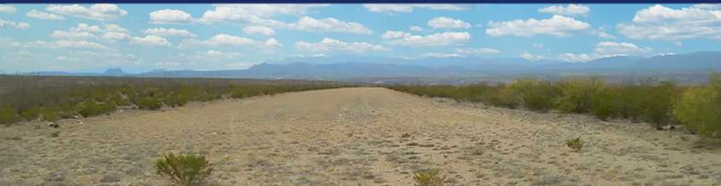
Accessibility to Ocotillo Ranch by small plane 3 miles away via well maintained runway 3TE4.